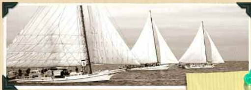
Scott's Cove Marina Chance, Maryland N 38.169158 W -75.947065 August 27, 2007